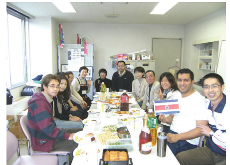
Potluck party is held once a month at UMEX salon