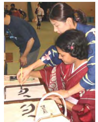
Calligraphy Session at Japanese Night