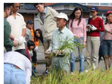
Explain how to use a sickle