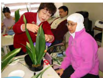
Flower Arrangement Class