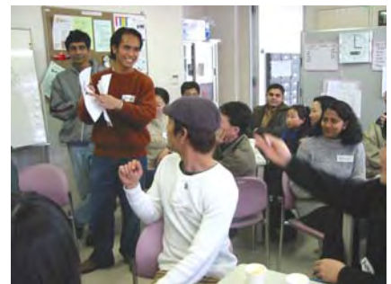
Chat in English gathering held once a month at UMEX salon

The UMEX salon is a place where everyone could meet and talk on a continuous and regular basis to foster interactions. It is an excellent gateway for IUJ students and their families to get to know local people and community.