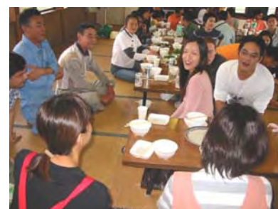
Exchange with people in Hirokami