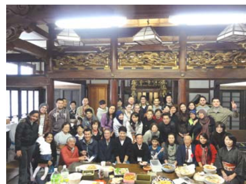
New Year's party

UMEX activities will be decided at the meeting of the working committee to be held at the beginning of every month. Please let us know if you have any suggestions and requests.