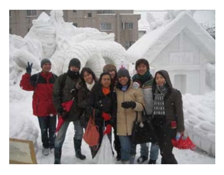
Bus trip for introduction of Japanese culture