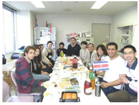
Potluck party is held once a month at UMEX salon

UMEX activities will be decided at the meeting of the working committee to be held at the beginning of every month. Please let us know if you have any suggestions and requests.