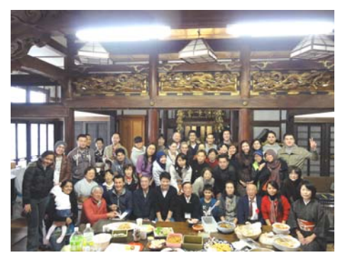
New Year's party

UMEX activities will be decided at the meeting of the working committee to be held at the beginning of every month. Please let us know if you have any suggestions and requests.