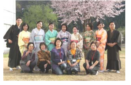
Bus trip for introduction of Japanese culture