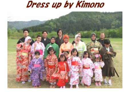
Bus trip for introduction of Japanese culture