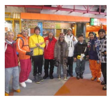
Country Introduction by students