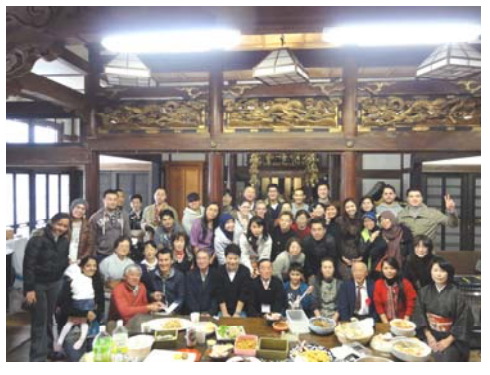
New Year's party

UMEX activities will be decided at the meeting of the working committee to be held at the beginning of every month. Please let us know if you have any suggestions and requests.