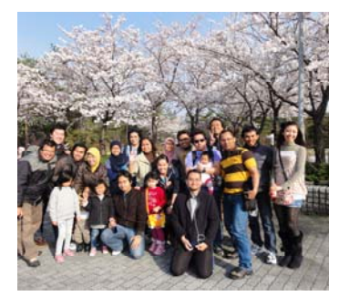
Country Introduction by students