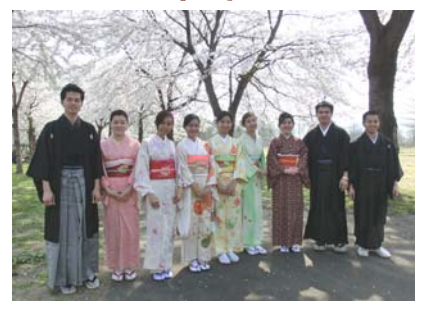
Bus trip for introduction of Japanese culture