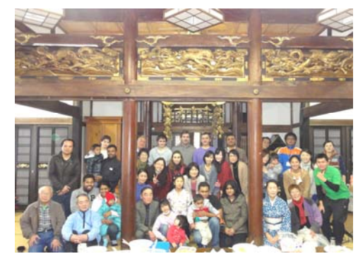
New Year's party