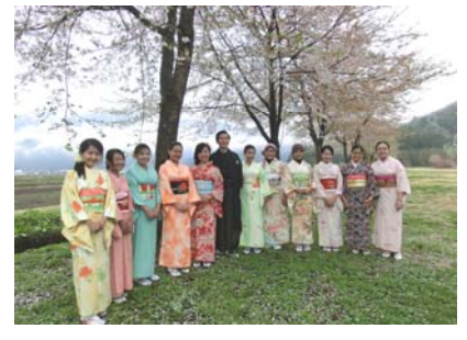
Bus trip for introduction of Japanese culture