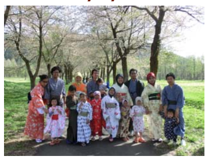
Bus trip for introduction of Japanese culture