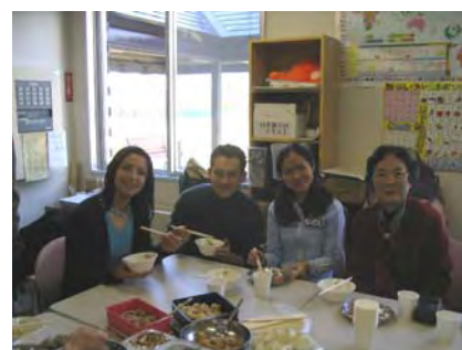
Friday Luncheon gathering is held once a month at UMEX salon

The UMEX salon is a place where everyone could meet and talk on a continuous and regular basis to foster interactions. It is an excellent gateway for IUJ students and their families to get to know local people and community.