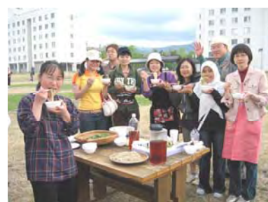
Sansai Garden Party

No wonder, taste of spring comes from a variety of SANSAI (wild vegetable) that we can find easily on IUJ campus ground and in the nearby mountains. It was an initiative of UMEX to arrange the garden party on May 15 at the barbeque site for students to enjoy the sweetness of SANSAI UMEX members and other local Japanese people show us how to cook SANSAI. Of course, we can boil SANSAI or make tempura. It was interesting that we can pick up the vegetable from the mountain and make delicious food from it. We ate SANSAI tempura with cold soba and soy sauce. I could not tell how tasty it was, but whenever