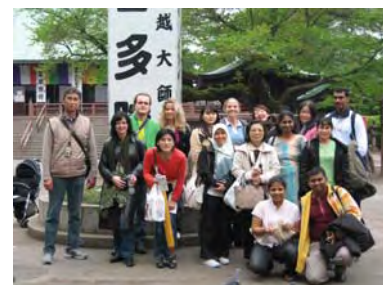
Bus trip for introduction of Japanese culture

UMEX is an important member of IUJ family. Let's keep and develop this portal of communication between campus and Japanese community in the New Year. Good luck and count on our support!