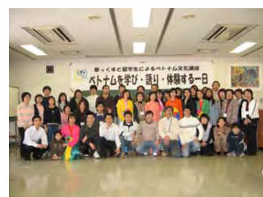
Country Introduction by students