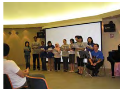
Charity concert for earthquake victims