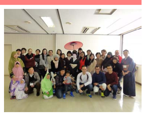
New Year's party

UMEX activities will be decided at the meeting of the working committee to be held at the beginning of every month. Please let us know if you have any suggestions and requests.