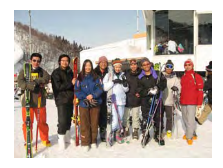
Bus trip for introduction of Japanese culture