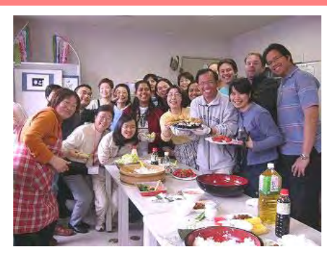
Potluck party is held once a month at UMEX salon

UMEX activities will be decided at the meeting of the working committee to be held at the beginning of every month. Please let us know if you have any suggestions and requests.