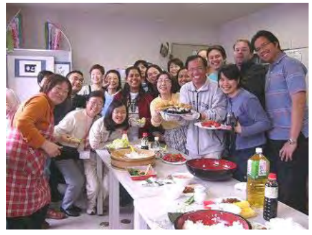
Potluck party is held once a month at UMEX salon

UMEX activities will be decided at the meeting of the working committee to be held at the beginning of every month. Please let us know if you have any suggestions and requests.